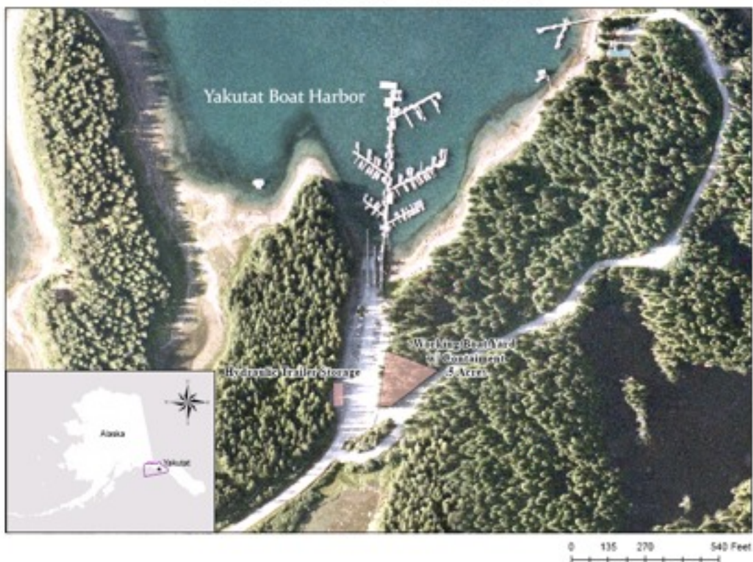
Boat Harbor Haul-Out Site Map

Providing large boat haul-out infrastructure would encourage more local participation in the various offshore fisheries, increasing access to a common property resource at Yakutat's doorstep. The city has formed a Community Quota Entity and wishes to pursue acquisition of blackcod IFQ. As these fish are twenty to sixty miles offshore, larger boats are necessary for entering this fishery. In addition, visiting vessels would have an option to make emergency repairs to their vessels avoiding a long and sometimes dangerous run to Sitka, Hoonah or Juneau.