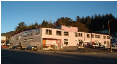
615 Stedman Facility

SSEATEC is a project of the Ketchikan Indian Community that will recognize community need and economic opportunity. Southern Southeast Alaska Technical School will be open to ALL Alaskans.