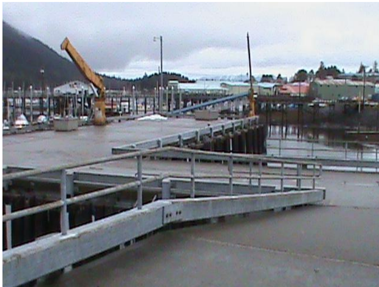
View From South Harbor Pedestrian Ramp Onto Crane Dock Access