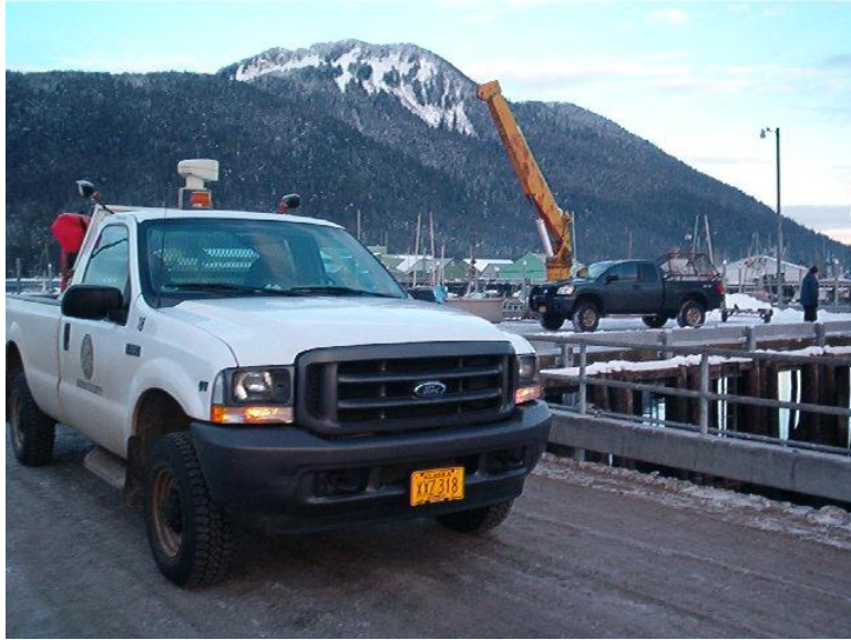
Vehicle Access on Crane Dock