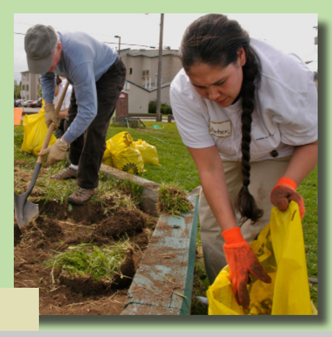
And Build a Stronger Anchorage