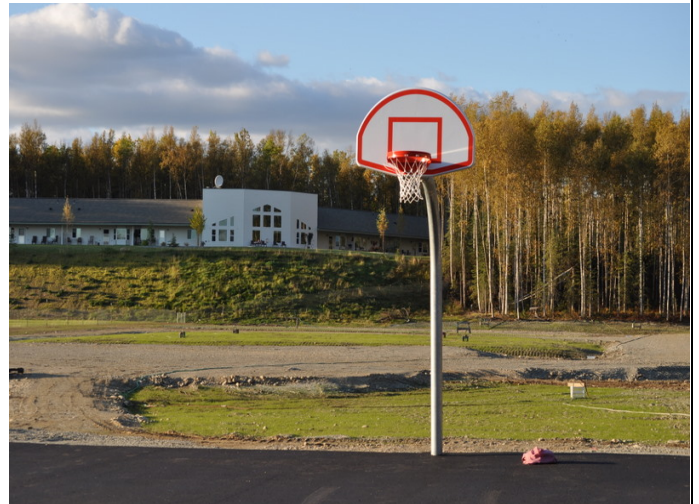
View of Basketball Court (final)