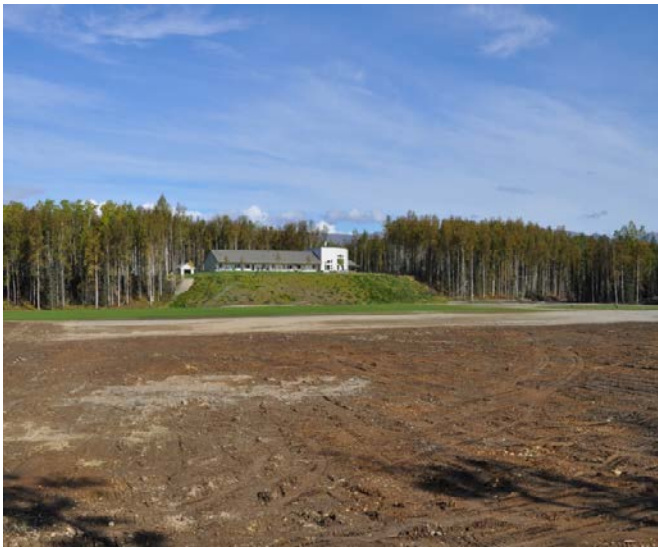
View of Future Softball Fields looking towards Soccer Field