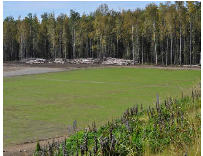
View of Soccer Field from Housing Complex