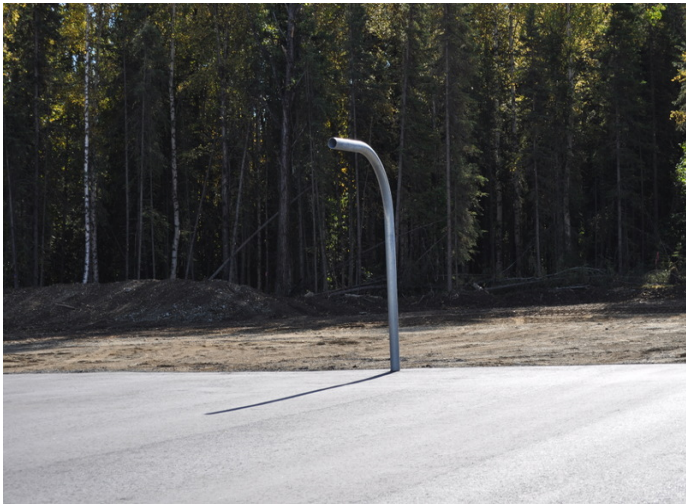
View of Basketball Court after paving