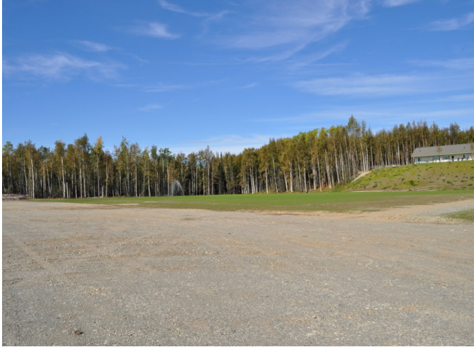
View of Soccer Field from Basketball Court

These photos were all taken September 2011