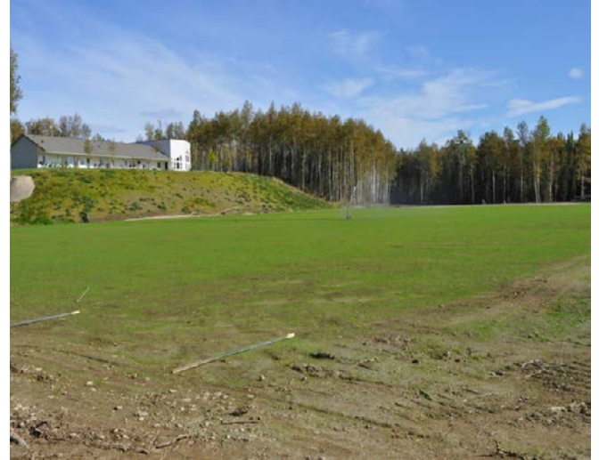
Soccer Field looking towards Housing Complex