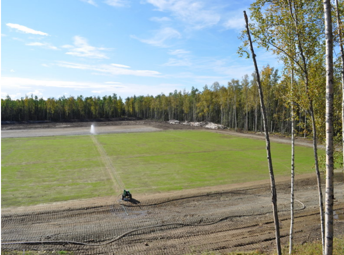
View of Soccer Field from Housing Complex

These photos were all taken September 2011