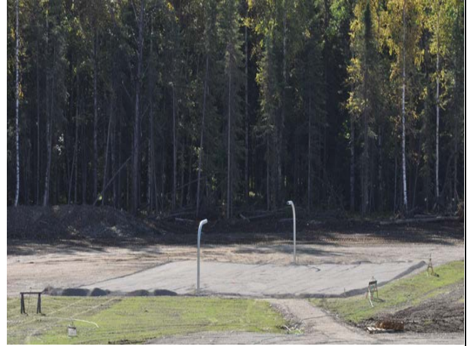
View of Basketball Court before paving