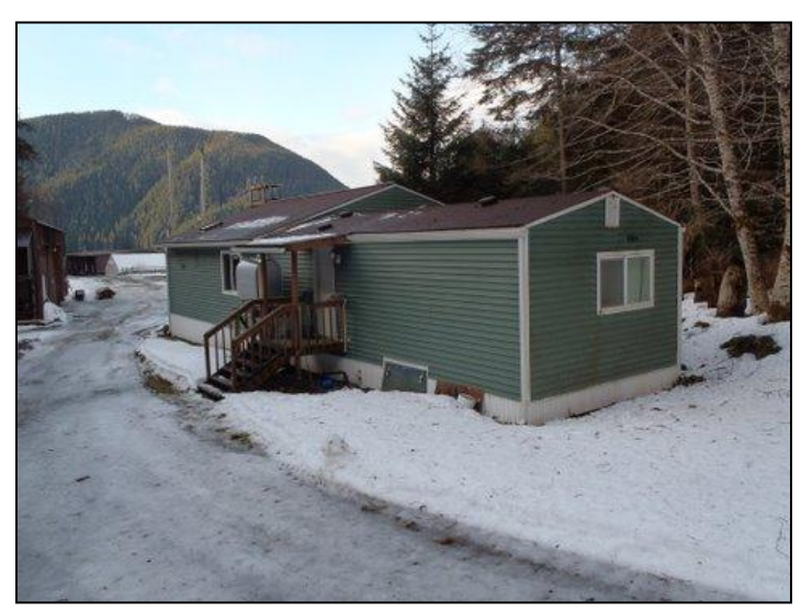
Staff Housing, Converted Trailer

As with previous project this would replace a failing roof and siding with insulated siding panels. Deteriorated and inefficient lighting and heating elements would also be replaced. Once again the goal would be to reduce electrical demand and operating expenses.