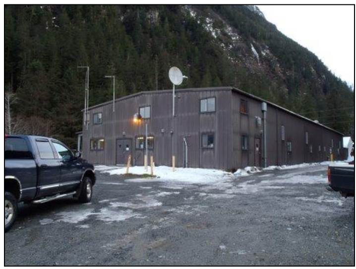
Coho Incubation-Rearing Building

This project would replace a failing un-insulated roof and siding with insulated roof and siding panels. In addition energy efficient windows and doors throughout the building would dramatically reduce electrical demands and energy costs associated with heating attached office, lab and lavatory facilities.