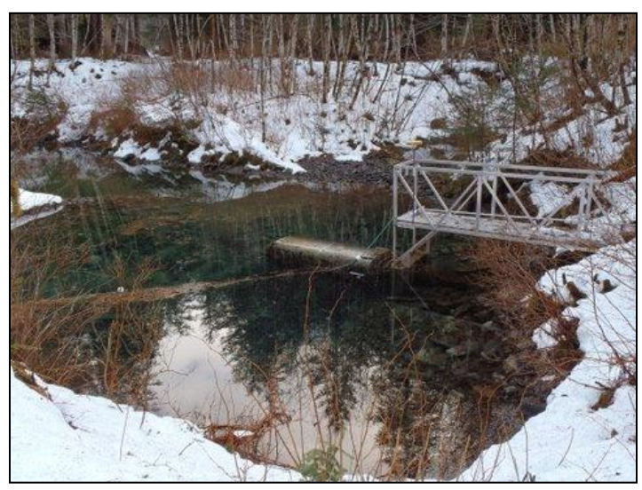
Medvejie "Pit" Intake

There is a lack of sufficient storage space for nets and feed at the site. Secure dry storage is needed to protect the nets and feed from the elements and bears. This expanded storage space would replace aging container vans currently being used.